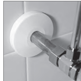
Give all your stub outs the professional look of the Trim Tite.