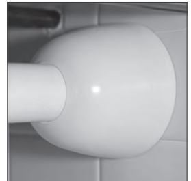
Covers most wall openings. Perfect for pedestal lavatory installations.