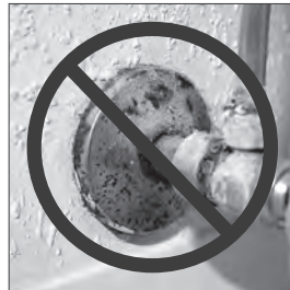
No more rust, corrosion or pitting.